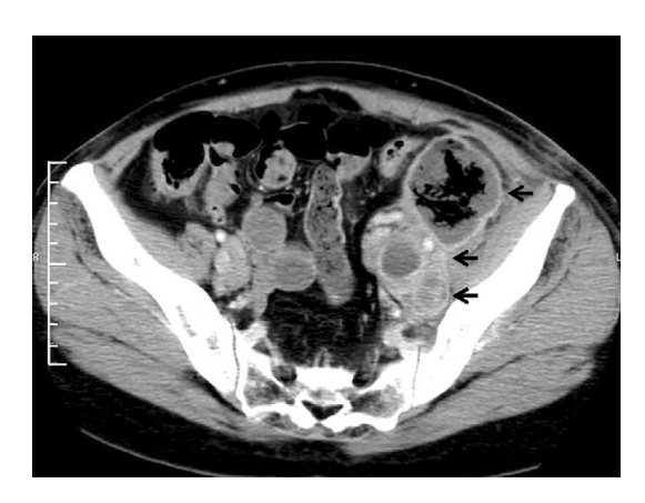
Figure 1. Abdominal CT on day 13 of the first cycle of CHOP showed a lymph node with air bubble-like structures and two cystic lymph nodes. The maximum size of the lymph nodes was around 6×5 cm.